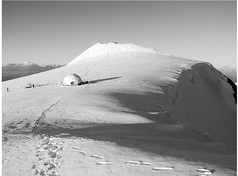
FIG. 2 - The drilling dome built at 3859 m near the summit of Mt. Ortles (3905 m) (Photo by Paolo Gabrielli).

temperate firn portion (< 30 m depth) into the lower part of the borehole re-froze. No antifreeze was used at any time during the drilling operations. Ice accretion was directly observed to occur at a refreezing rate of \sim 0.7 mm/h in an ice cross section retrieved at a depth of 56 m in borehole #1 (fig. 3). This rate was calculated as the thickness of newly formed ice accreted overnight to the borehole divided by the time interval occurred between the last and the first drilling runs over two consecutive working days.